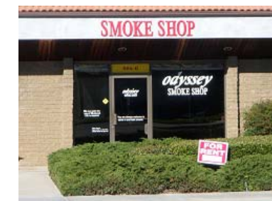
This smoke shop in Vista went out of business after law enforcement confiscated illegal paraphernalia.

When April 20 fell on Sunday in 2008, the event expanded beyond the school grounds to the Oceanside Pier Amphitheater and included a Battle of the Bands event. In addition, proclamations were issued by elected officials throughout San Diego County declaring April 20th Sober and Drug-Free Life Choices Day.