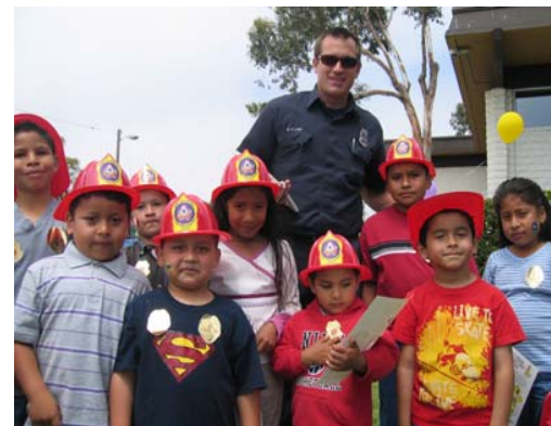
Día Del Niño Celebration, children interacting with firemen and learning about fire prevention.

In December 2008, another event brought together over 100 community members to La Posada, a traditional Latin holiday celebration. Neighborhood members of all ages enjoyed food, and children took turns breaking a piñata. All children received a goody bag with candy.