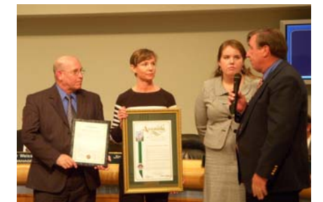
City of Oceanside and Representative from State Senator Wyland recognizing NCPC for 2008 CADCA award.

"Stay Smart, Don't Start— The Truth About Drugs and Alcohol."