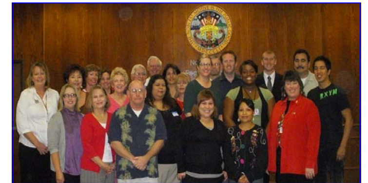
North Coastal Prevention Coalition members at monthly meeting— Representative from Congressman Brian Bilbray presents a resolution in honor of NCPC's CADCA award on December 11, 2008.

Coalition efforts include the support of "social host" ordinances to reduce underage drinking at home parties, enforcement of regulations to eliminate the sale of drug paraphernalia, and tobacco retail licensing to hold businesses accountable for tobacco sales to minors.