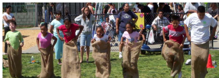
Eastside Neighborhood children enjoying their special day—Día del Niño.

One of the association's major events is Día del Niño (Day of the Child), an effort to promote positive neighborhood activities in the local park and celebrate children.